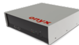
» MedPC-1700, 1200