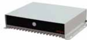
» MedPC-5500, 5300

Onyx's compact MedPC series, a fanless, rich I/O interface and medical certified embedded computer offers many medical OEMs a highly reliable platform with simple, quick and low cost solutions. From the intel ATOM Core Dual D525 to the latest i7 Quad Core Ivy Bridge processor to the AMD Fusion chipset, MedPC offers the latest Off-the-shelf CPU technology. With MOQ of 50pcs, any color or logo is supported.